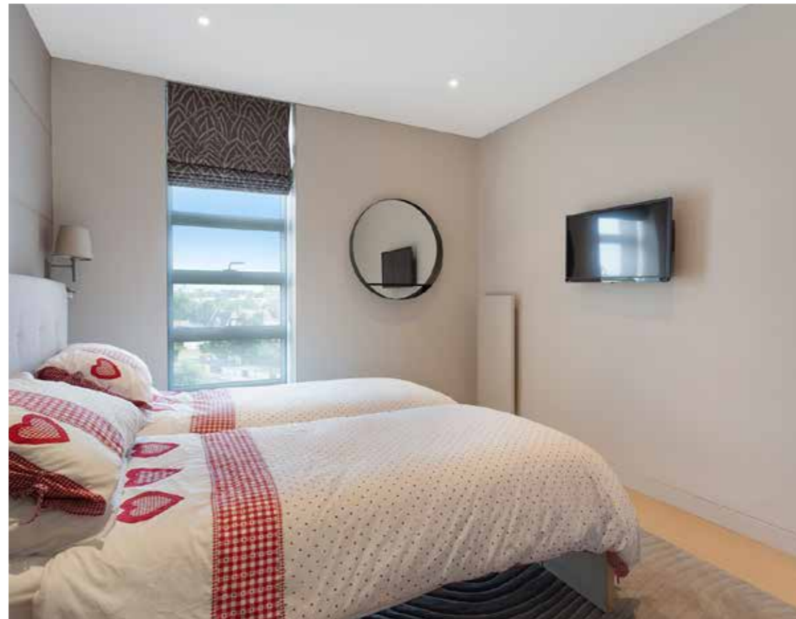
Montevetro Building London, SW11 • Guide Price £2,000,000 • Share of Freehold